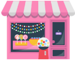
_____ Sweet shop _____