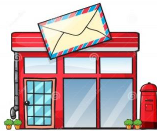
_____ Post office _____