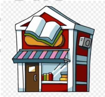
_____ Book shop _____