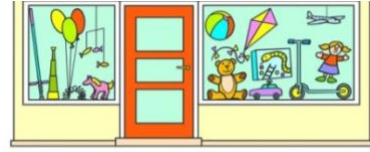
_____ Toy shop _____