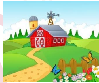
_____ Farm _____