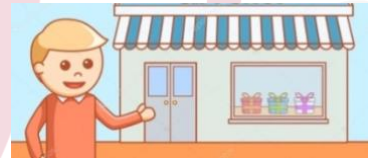
_____ Gift shop _____